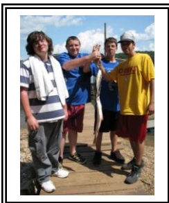
Fish Camp One