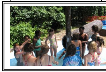
Girls Camp Three So many girls hurting and needy that many of the women counselors are crying