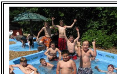
Boys Camp Two Many needy, tearful boys