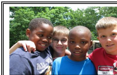
Boys Camp One Considerate boys