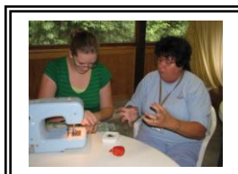
Cook and Sew