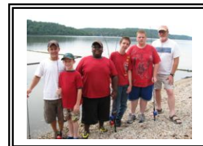
Fish Camp Two