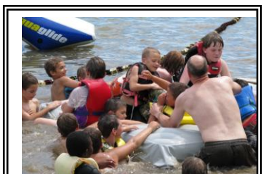
Boys Camp Three There is no victory without a battle